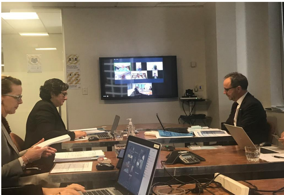
The 23 rd Governing Board online meeting in session

The Governing Board discussed key strategic, governance, and operational matters and a proposed suite of programs designed in response to SAI needs, the results of the 'Supreme Audit Institution Performance Measurement Framework' and the COVID 19 situation. The Secretariat's transition towards adopting a blended learning training model, with a short-term focus on online learning was also discussed. The Board was updated on the Secretariat's Digital Transformation program including the set up of a Learning Management System and the digitalisation of inhouse Business Intelligence function to strengthen monitoring, evaluation and reporting activities.